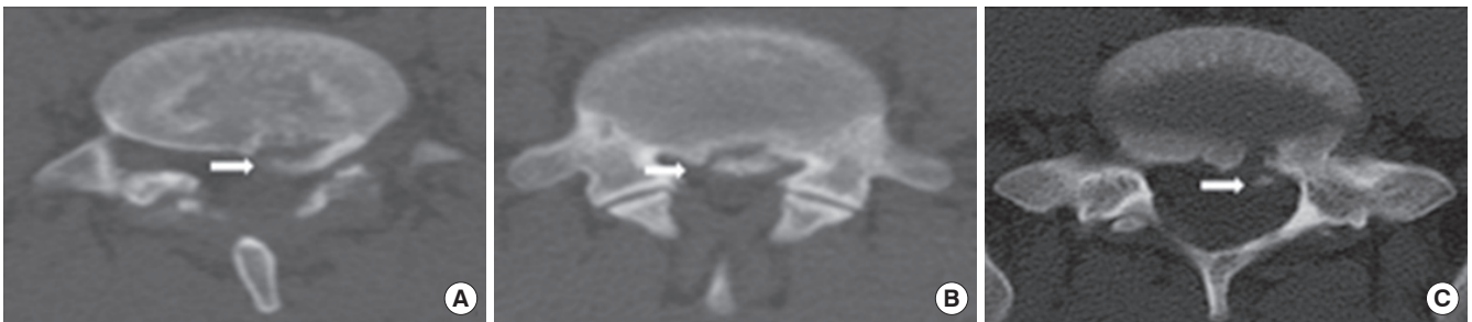
Fig. 1. Classification of posterior apophyseal ring fracture. 22 (A) Type 1, an arcuate simple avulsion of the posterior cortex of the endplate without osseous defect. (B) Type 2, an avulsion fracture of the central cortical and cancellous rim of posterior vertebra. (C) Type 3, a more lateral localized fracture involving a larger amount of the vertebral body, resulting that osseous defect anterior to the fragment is larger than the fragment. Arrow indicates the lesions of posterior apophyseal fracture.

The characteristics of patients with PARE versus those without PARE are presented in Table 1. Amongst the clinical manifestations in each group, there was only one significant result in the severity of whole discomforts using VAS: median VAS 6 (4–7) in patients having PARE versus median VAS 4 (3–5) in patients without PARE. However, we did not find any significant